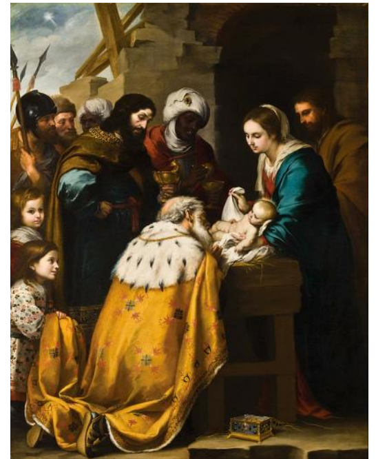
The Epiphany of the Lord